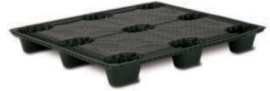
Oval 9 leg Design